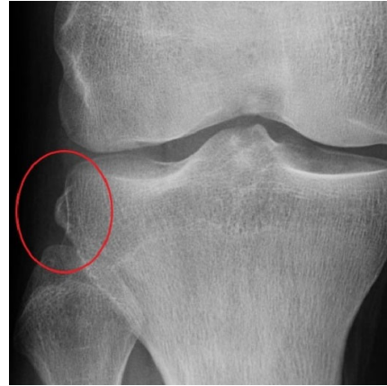
Figure A2 – “Healed Segond” on coronal radiograph