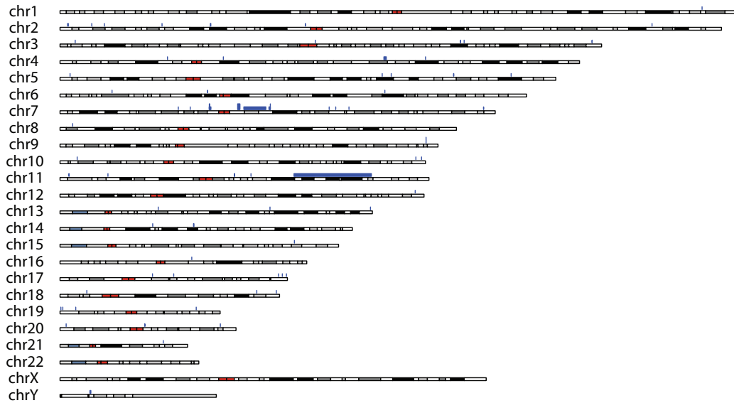
eccDNA distribution on various chromosomes