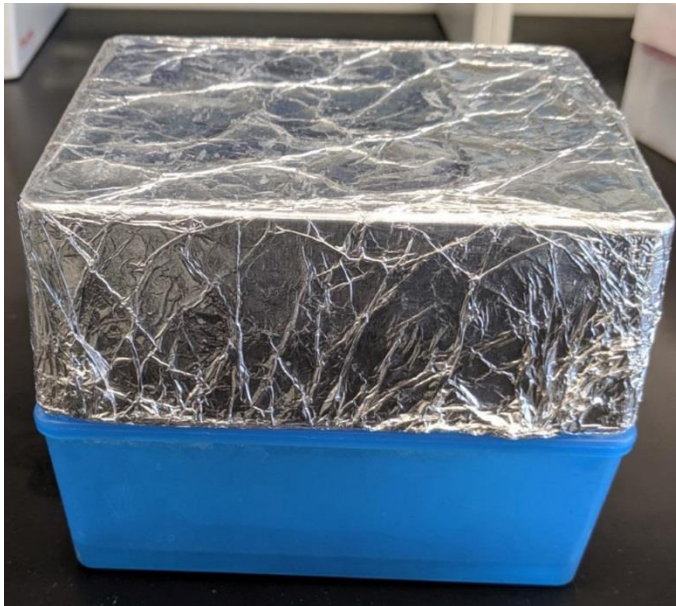
Picture S4: Humid chamber made with a P1000 tip box. The lid is wrapped with tin foil to minimize light exposure to slides placed inside. Lid should be placed on when slides are inside.