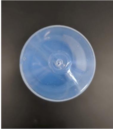
Picture S1: A modified 50ml conical tube with a small hole made at the bottom with a 25-gauge hypodermic needle.