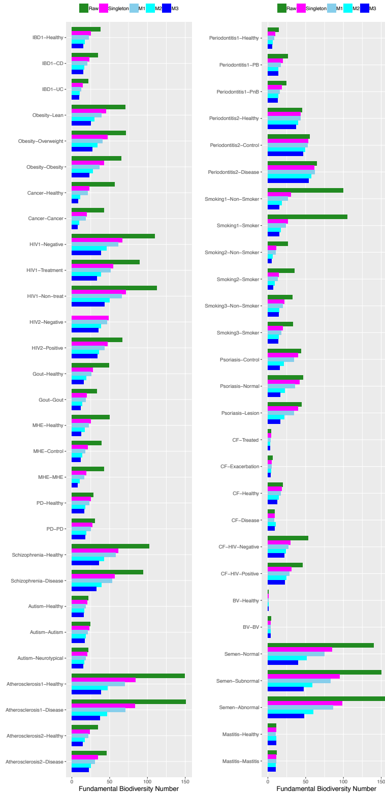
Fig S2. The fundamental diversity number ( \theta ) for each of the 24 case studies: for each case study, the test results for five data pre-processing schemes are plotted (Related to Fig 3).