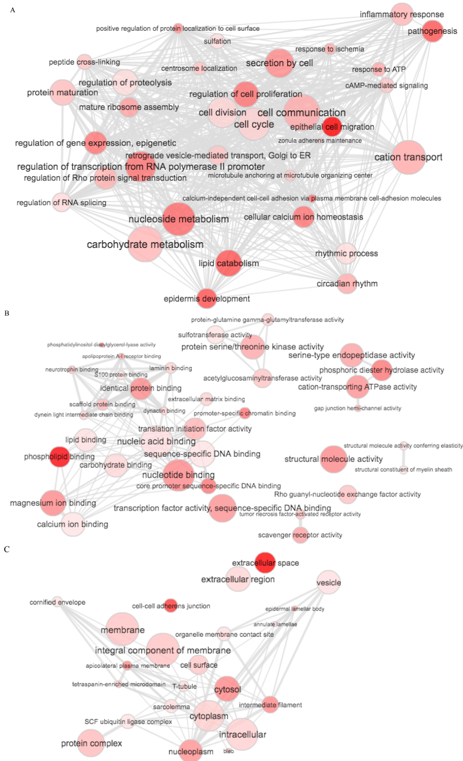
Figure S2. Network graphs for GO domains (A: biological process, B: molecular function and C: cellular component) of skin up-regulated genes. Greater colour intensity indicates higher fold change in expression in caecilian skin, and circle size is positively correlated with number of genes with the same GO in the UniProt database.