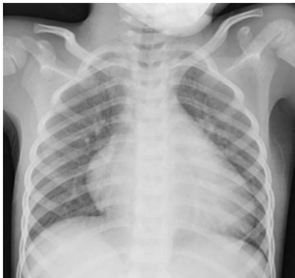
Fig.1 Chest radiograph showing enlarged cardiac silhouette.

He was transferred to the pediatric intensive care unit because of hypotension. He received fluid boluses and intravenous immunoglobulin (IVIG) therapy was begun, which had to be discontinued because of recurring hypotension. He was briefly supported with high flow nasal cannula up to 10 liter for tachypnea and increased work of breathing, which was weaned-off. Once he was hemodynamically stable, IVIG infusion was resumed slowly at 5 grams over 10 hours (2-5 mL/minute) for 6 doses for a total dose of 30 grams (1.8 g/kg) [1] with a