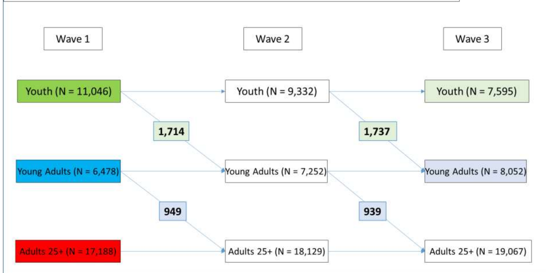
Supplemental Figure 1 – Tracking Wave 1 Respondents Through All 3 Waves of the PATH Study