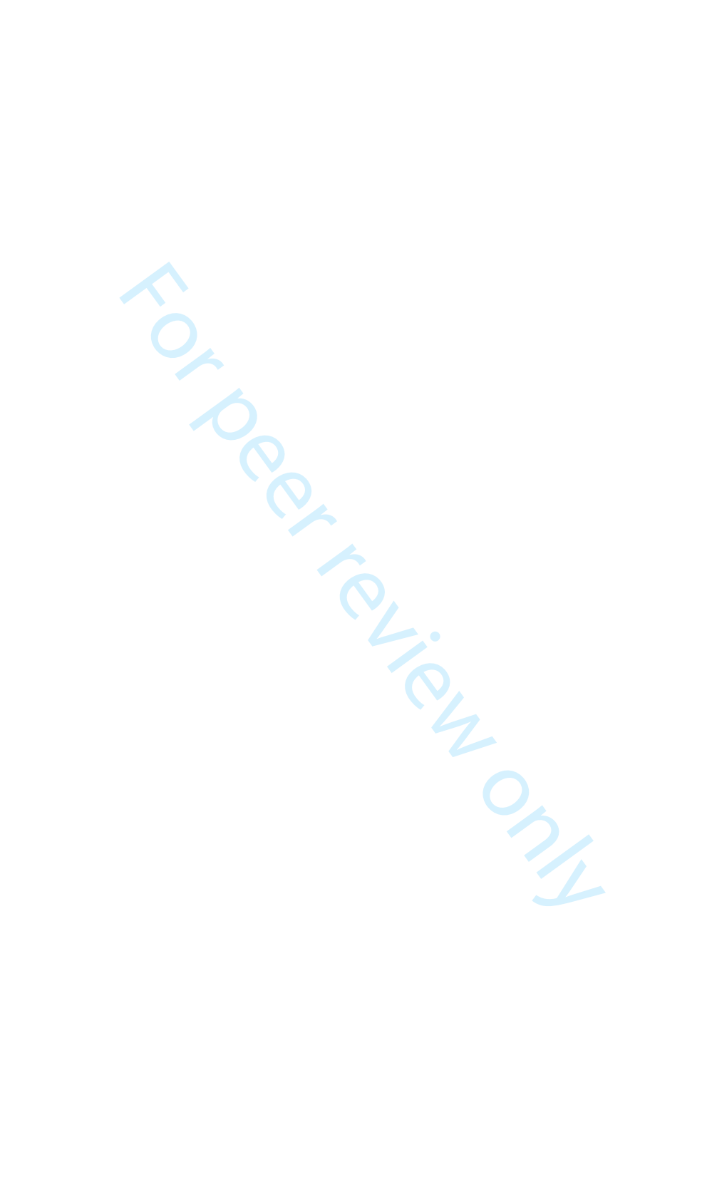
Figure 1: High-level overview of our methods in each of five work packages (WPs)