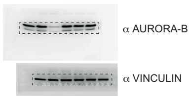
Extended Data Figure 3b