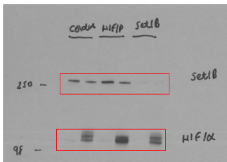
Extended Data Figure 1i: