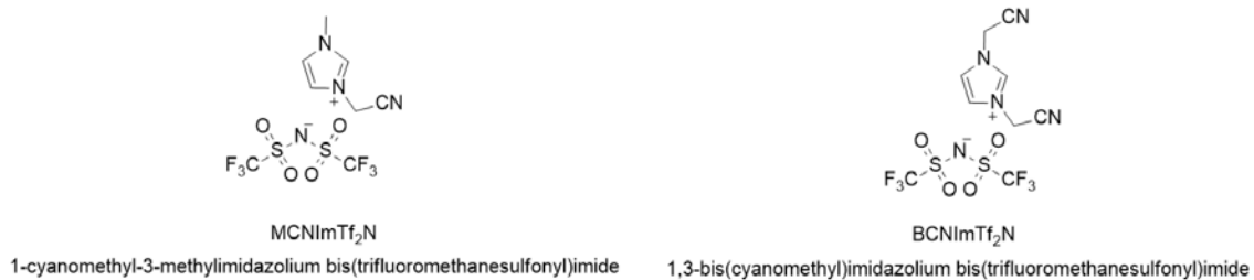
Figure S3. Chemical structures of ILs used for the construction of micro/mesoporosity.