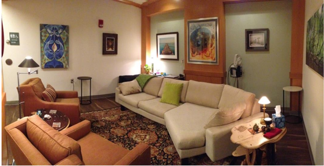
Study room in the University of Wisconsin-Madison School of Pharmacy