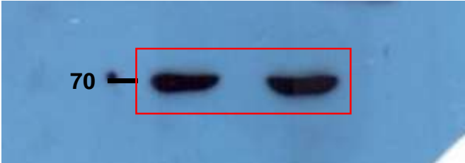
WCE: \alpha -PRMT5