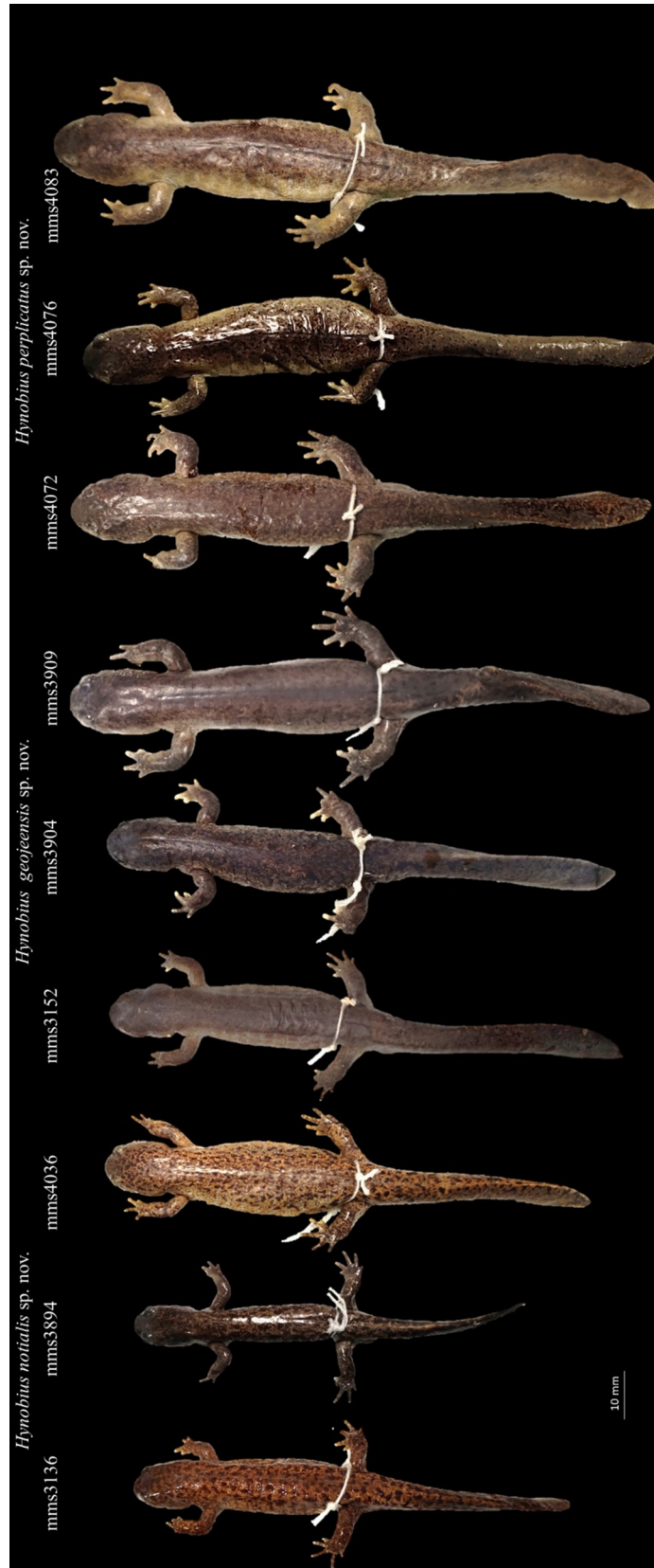
Figure S3. Paratypes for all Hynobius species described in this paper: H. notialis sp. nov., H. geojeensis sp. nov. and H. perplicatus sp. nov. The field ID is given above each individual. Details on measurements are given on Table 9.