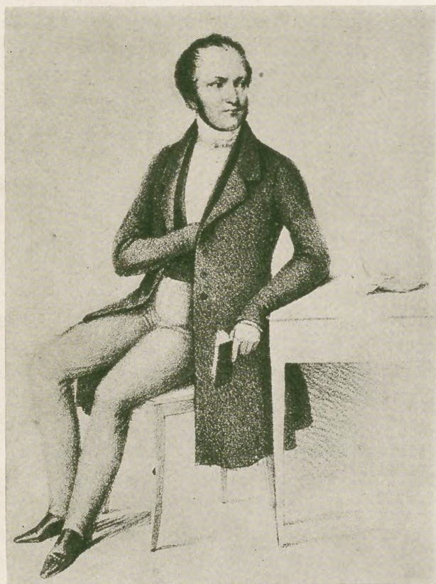
FIG. 1. Johannes Müller.

In this way the conception of cancer as a general disease, or as due to a special diathesis, persisted until the nineteenth century, when with the advent of the cell theory ( omnis cellula e cellula ) Johannes Müller and Virchow convinced the world that cancer consisted of an abnormal growth of abnormal cells. Again hypotheses as to the underlying cause of this abnormality became rife. This is not the place to do more than mention some of these; and at any rate the principal ones, Virchow's chronic irrita-