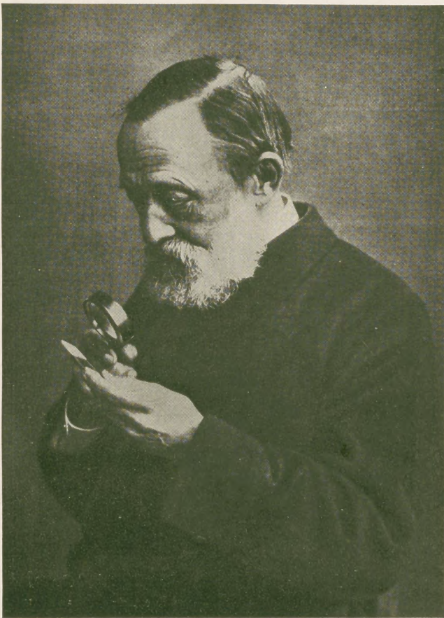
FIG. 3. RUDOLF VIRCHOW [1821-1902].