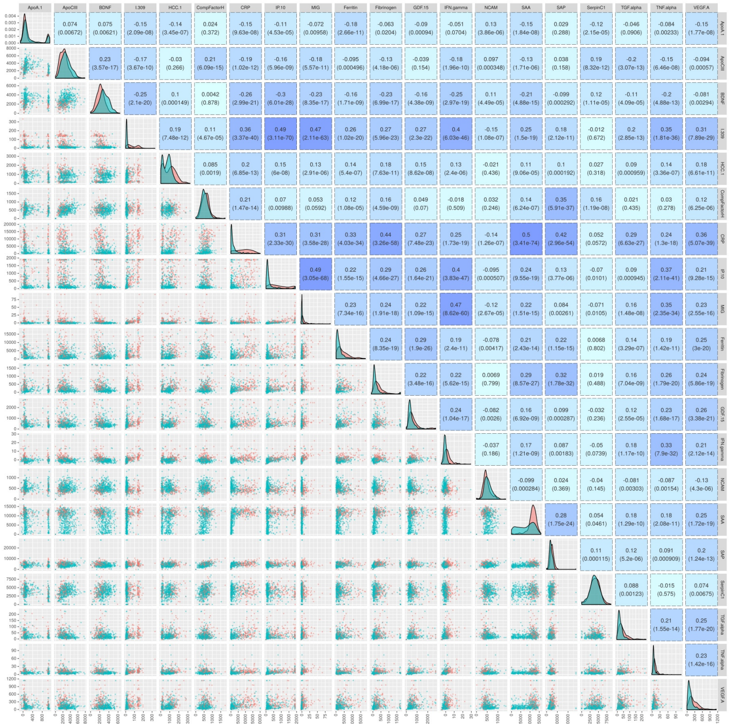
Supplementary Figure 1. Pairwise correlation plot of fluorescence intensity for all markers. Cyan=TB-negative, Pink=TB-positive. The diagonal shows the density distribution for the marker in each column. The upper triangle shows the correlation coefficient with the p-value in parentheses. Darker background colour indicates higher correlation.