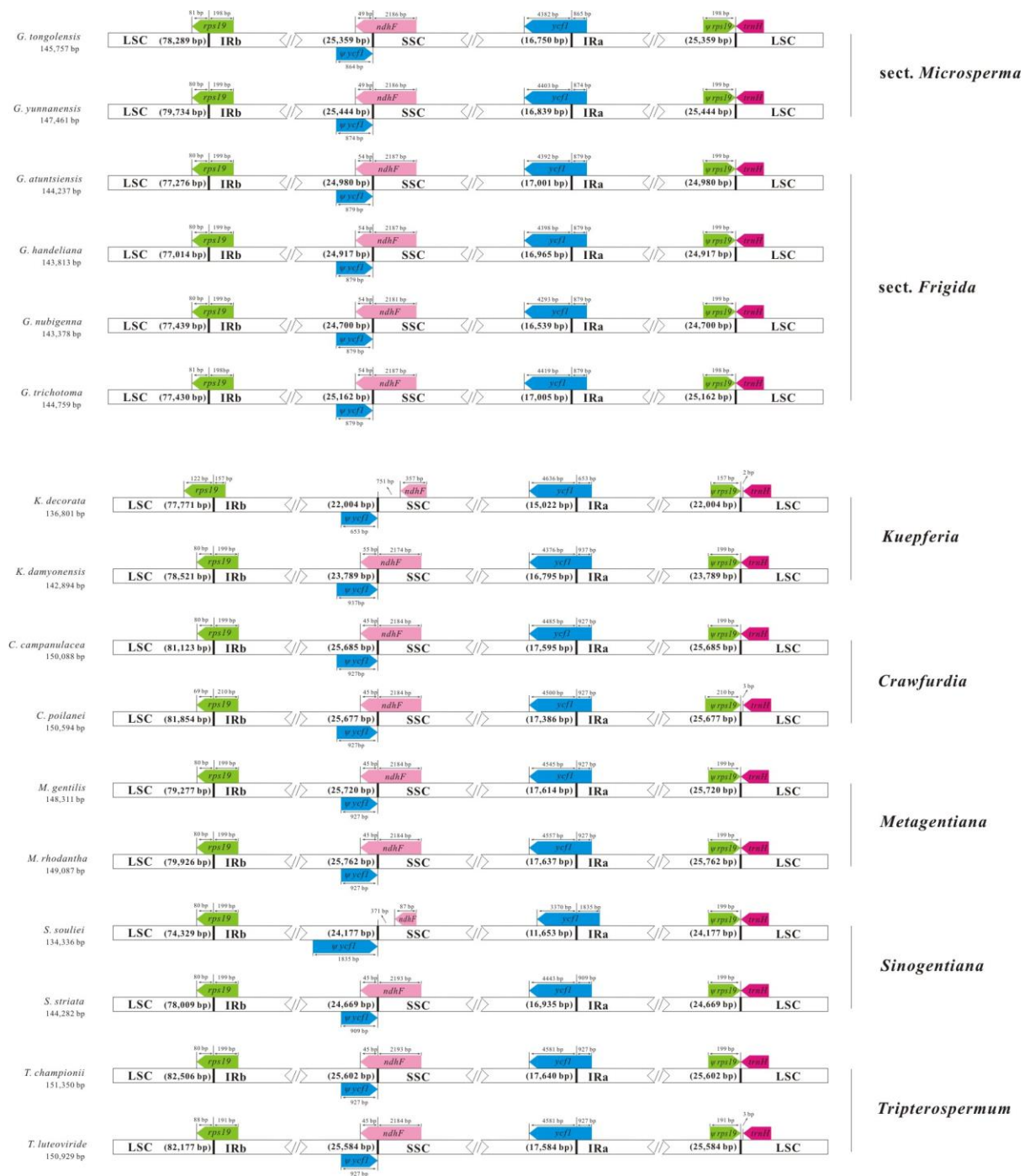
FIGURE B2 Comparison of LSC, IRs, and SSC junction positions among all newly sequenced plastomes in subtribe Gentianeae, along with seven published plastomes in Gentiana sect. Kudoa .