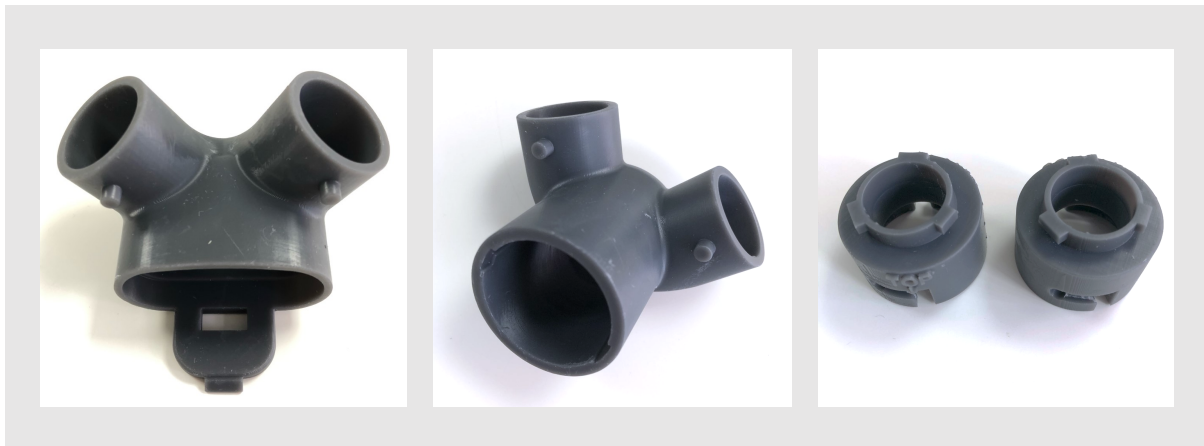
S1 Fig 4. Examples of the 3D printed connectors used in the experiments

Filters were attached to the snorkel masks using bespoke 3D printed connectors. The dimensions were measured manually with high precision rulers and 3D computer aided designs (CADs) were made in Fusion 360 software (Autodesk, Mill valley, California). Connectors were printed using a FormLabs 3 printer (Formlabs, Somerville, Massachusetts) at a resolution of 100 \mu\text{m} layers using Tough 2000 resin (Formlabs, Somerville, Massachusetts). The prints were then washed 2x 10 mins in 100% propyl 2 alcohol before being cured at 70° C for 1 hour. CADs for the connectors and images of the printed pieces are available for free download at: https://www.ImperialHackspace.com/COVID-19-Snorkel-Respirator-Project/