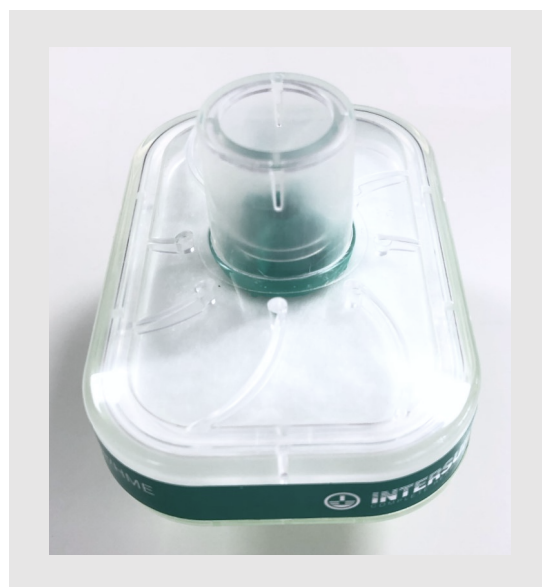
S1 Fig 3. Intersurgical Filtatherm filter

Intersurgical 'Filtatherm' (Intersurgical, Wokingham, UK): these filter attachments are designed to sit in-line within a mechanical ventilator circuit to allow filtration of particulate matter but retention of moisture and heat. They weigh 42g and feature round 22F male and a 22F male/15F female connector. The "patient" side of the filter was attached to the inflow of the snorkel mask using 3D printed adaptors. They have a 99.999% filter efficiency(3). They were chosen because of low price and wide availability in intensive care units globally.