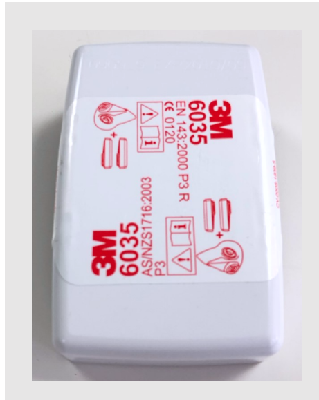
S1 Fig 2. The 3M 6035 P3 filter

Intersurgical 'Filtatherm' (Intersurgical, Wokingham, UK): these filter attachments are designed to sit in-line within a mechanical ventilator circuit to allow filtration of particulate matter but retention of moisture and heat. They weigh 42g and feature round 22F male and a 22F male/15F female connector. The "patient" side of the filter was attached to the inflow of the snorkel mask using 3D printed adaptors. They have a 99.999% filter efficiency(3). They were chosen because of low price and wide availability in intensive care units globally.