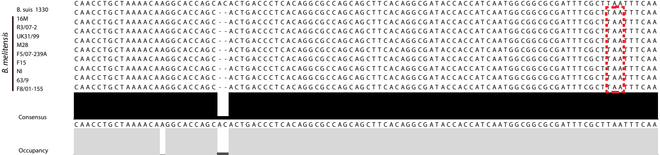
Supplementary figure 8:

Multiple alignments of conserved mutations of (A) bmaA orthologues of B. melitensis , (B) bmaB orthologues of B. abortus and (C) bmaC orthologues of B. melitensis . Conserved mutations are pointed by red arrows and non-sense mutations generated de novo are marked by dotted line squares.