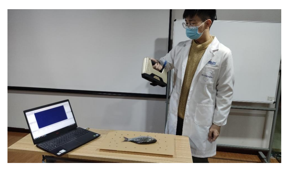
Supplementary Figure S1. Data acquisition via non-contact fish scanning using GScan. Mark points were labeled on a yellow board as background. Point cloud was transferred directly to 3DPhenoFish for analysis.