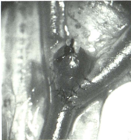
Fig. 2. —Experimental aneurysm at arterial bifurcation on rabbit carotid artery immediately after surgical production. Aneurysm is 4 mm long and 3 mm wide.

performed by using interrupted 10-0 monofilament nylon sutures (Fig. 1C). The vein segment was then sutured to the notch formed by the anastomosis (Fig. 1D). The free end of the vein segment was ligated with 5-0 silk, creating the dome of the aneurysm. All the clamps were then removed to allow filling of the vein pouch with blood (Fig. 2). A small polyethylene sheet was folded over the anastomosis site to control minor bleeding from the suture line. Once bleeding ceased, the sheet was removed. Any ligated side branches on the vein pouch were coated with a very small drop of cyanoacrylate glue. † This strengthened the ligated side branch to reduce the risk of its rupture. Care was taken not to apply the adhesive to the aneurysm wall. After the procedure the rabbit was placed on a heating pad for an hour.