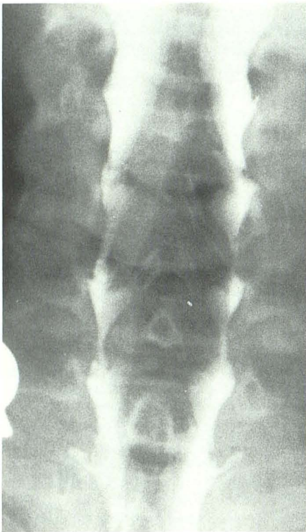
Fig. 1.—Cervical myelogram shows enlargement of spinal cord extending from C4 to C7.