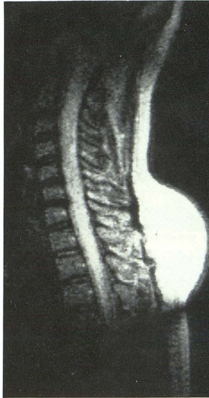
Fig. 2.—Spin-echo T2-weighted MR image (TE 100, TR 1700) using a spine coil shows diffuse increase in signal throughout enlarged spinal cord. Spin-echo T1-weighted images (TE 35, TR 600) revealed only cord enlargement.