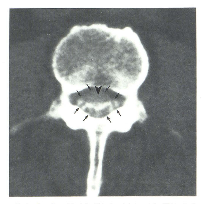
Fig. 2.—Case 2: partial subdural injection. Anterior subdural fluid collection ( arrowhead ) displaces opacified subarachnoid space posteriorly. Convex margin suggests a soft-tissue mass; however, the intact circular dural margin and epidural fat ( arrows ) suggest a subdural collection. Metrizamide myelography revealed only displacement of opacified subarachnoid space from vertebral body.

Subdural and epidural metrizamide collections may occur during metrizamide instillation as a result of either direct injection of contrast material through a malpositioned spinal