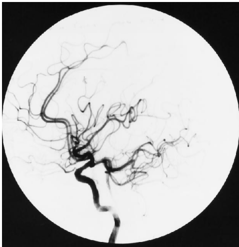
Fig 1. Angiogram shows reflux of contrast medium into the basilar artery during internal carotid angiography. This patient had no stenosis of the vertebral and subclavian arteries.

was stable. The injection catheter tip was placed at the C5-6 level in the common carotid artery and the monitoring catheter tip was placed at the ipsilateral mid C-2 level in the common carotid artery. An automatic power injector (Contrac 4E, Siemens, Germany) was used for the injection of contrast material.