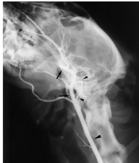
Fig 3. Carotid angiogram in a dog. Blood pressure monitoring sites are at the C-2 level in the common carotid artery (large arrowhead), the proximal and distal portions of the external carotid artery (arrows), and, when possible, the proximal and distal portions of the internal carotid artery (small arrowheads). In dogs, the internal carotid artery is very small compared with the external carotid artery.

An important technical matter is how the blood pressure changes in small arteries were measured. When coaxial catheters were displaced or wedged by the impact of the injection, we could not get correct measurements. The Mikro-tip catheter, which has a pressure sensor at the tip, was better in this regard than the other coaxial catheters,