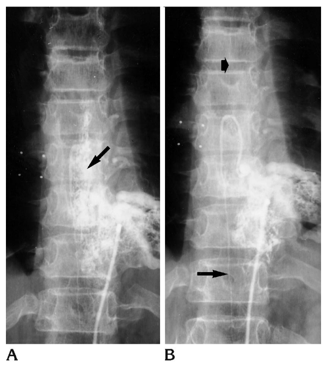
Fig 1. Spinal cord arteriovenous malformation (AVM) in a 32-year-old man with a dramatic paraparesis due to Cobb syndrome.

The spinal cord malformation (arrow in A) was fed by the anterior spinal artery (B). Embolization with 600- \mu m-diameter microspheres allowed a satisfactory occlusion of the afferences to the spinal cord AVM, with preservation of the descending branch of the anterior spinal artery ( long \ arrow \ in \ B ). After embolization, paraparesis totally disappeared. Note the reappearance of the ascending branch of the anterior spinal artery ( short \ arrow \ in \ B ).