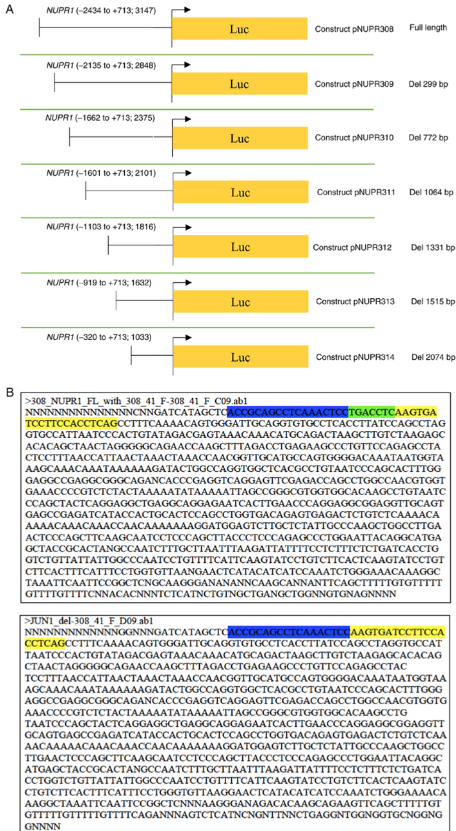
Figure S1. pGL4 luciferase vector construction including the NUPR1 promoter and JUN binding site deletion. (A) Series of deletion fragments of the NUPR1 promoter sequence were inserted into KpnI and HindIII sites of the pGL4-basic reporter vector. The sizes of inserts are shown immediately upstream of each start site. The length of the base pairs removed from the original full-length promoter clone, where nucleotides -2434 to +713 were inserted (construct pNUPR308), are presented on the right side of the name for each construct. The transcription start site is located at nucleotide 2499 according to GenBank submission AF069074, which is designated as +1. (B) Sequencing information showing the JUN binding site deletion from the NUPR1 full length promoter construct (i.e. pNUPR308). The JUN binding site corresponds to position -2339 to -2333 in pNUPR308. NUPR1, nuclear protein 1.