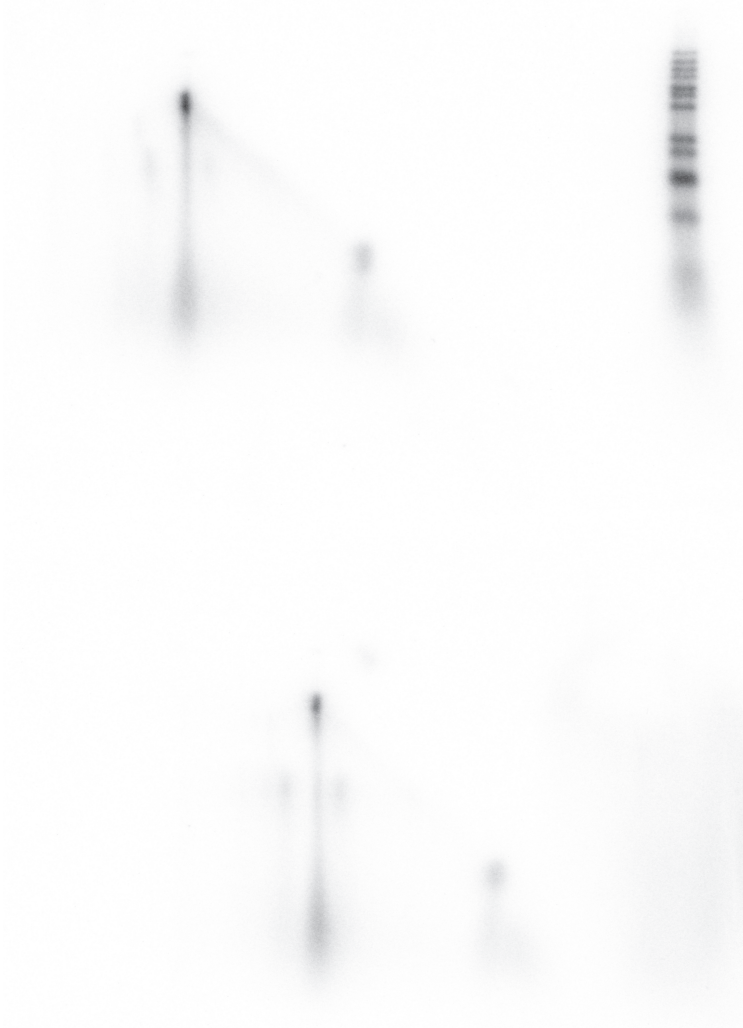
Figure 2E - 2nd dimension (alkaline)