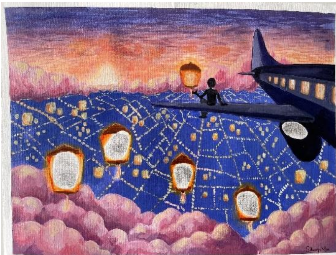
61 eFigure2. Painted by Apurva Chaturvedi. Materials: black India ink and acrylic paints.