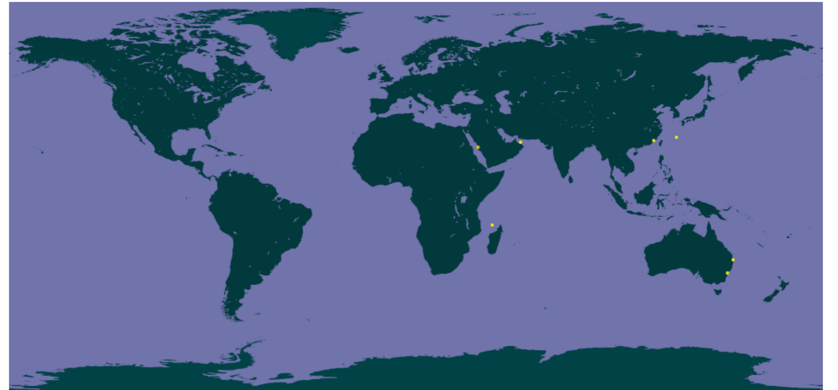
E ( S. grevillei )