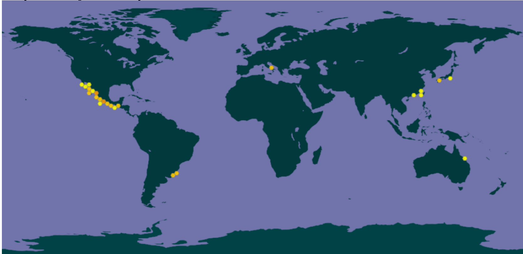
B ( S. tropicum )