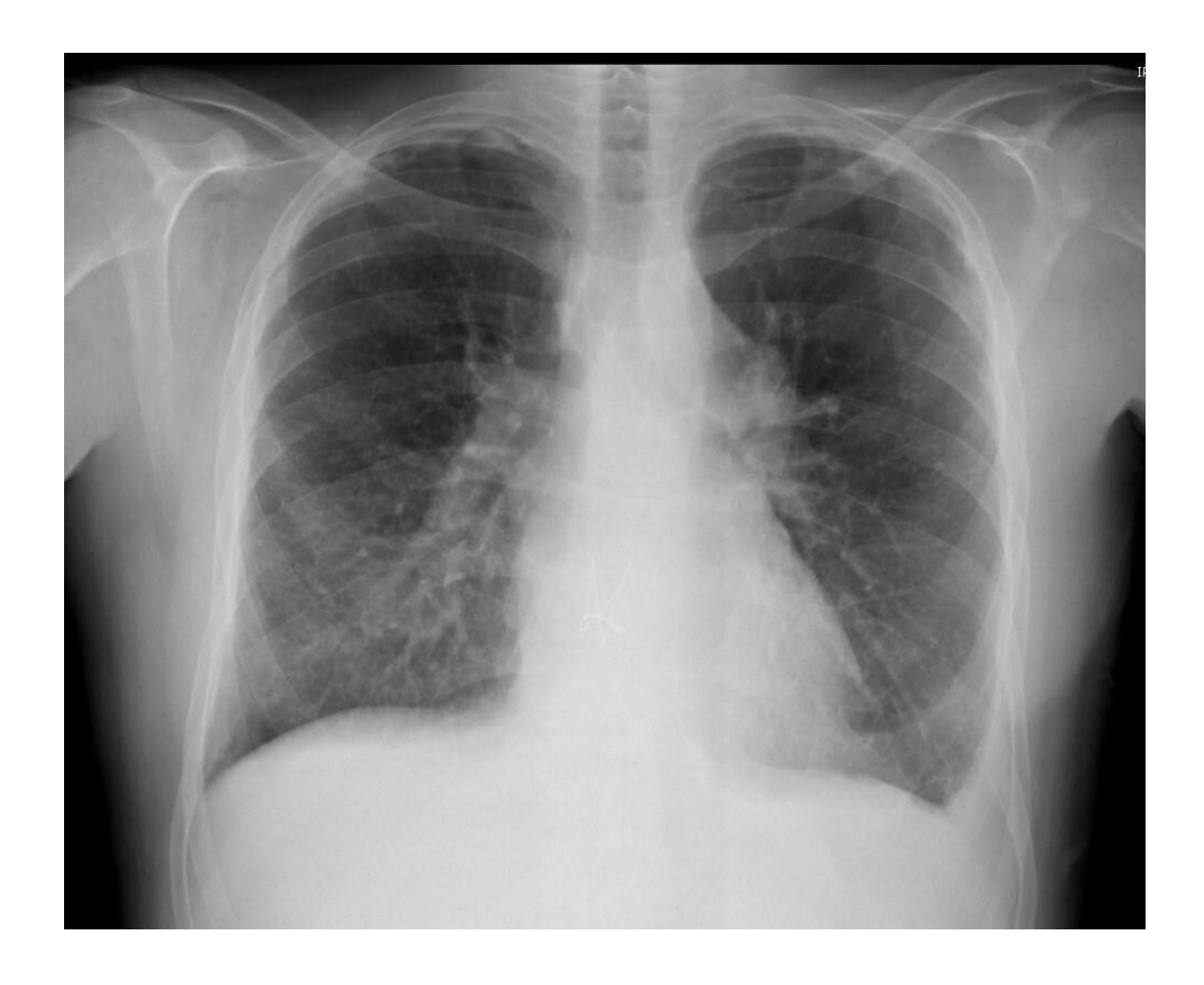
Figure S3. Recipient chest radiograph at one year after transplantation