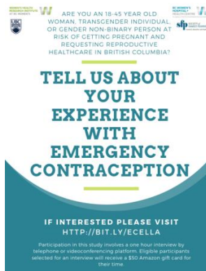
Twitter Image 2 download