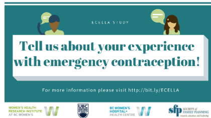
Twitter Image 1 download