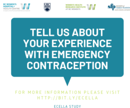
Facebook Image 1 download