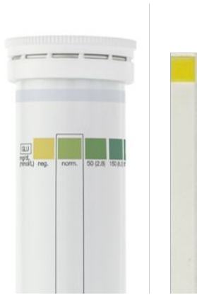
Figure S2. Test strips for detection of glucose in urine show no presence of glucose in the collected urine samples.