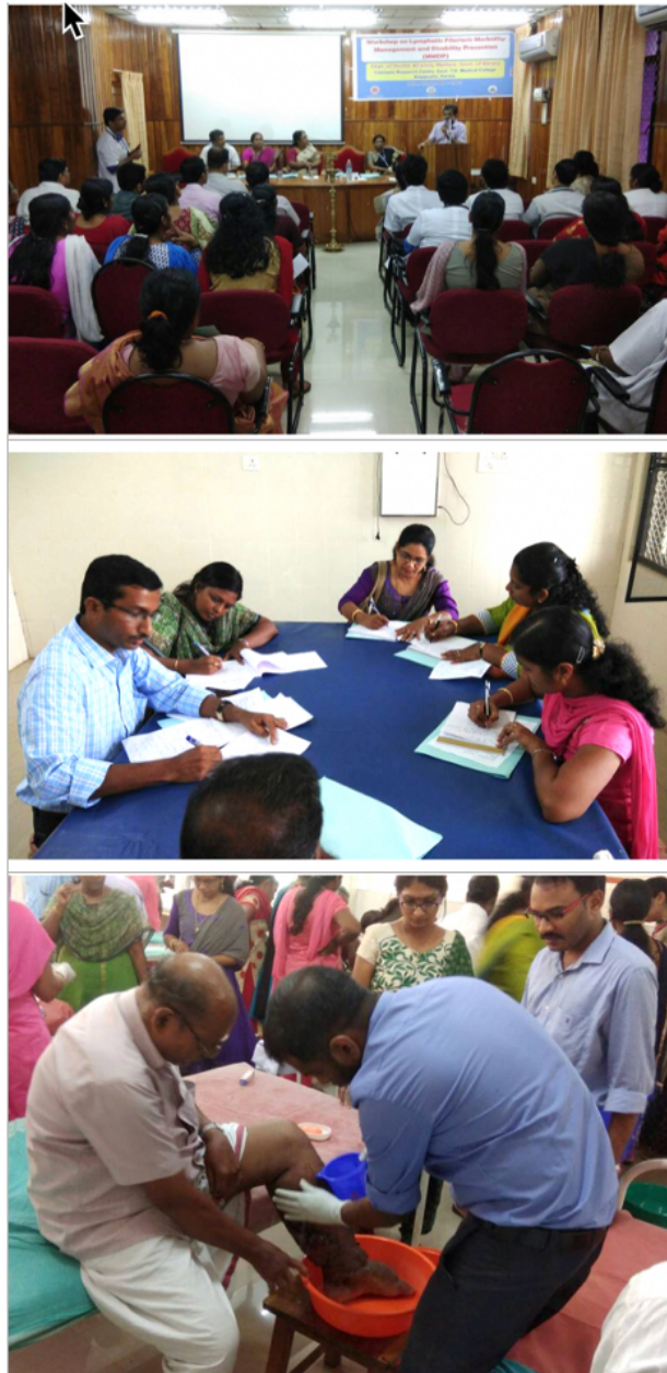
Figure 3. Comparison of the pre-test and post-test scores for 20 questions asked of each participant in each of the 6 different training session groups.