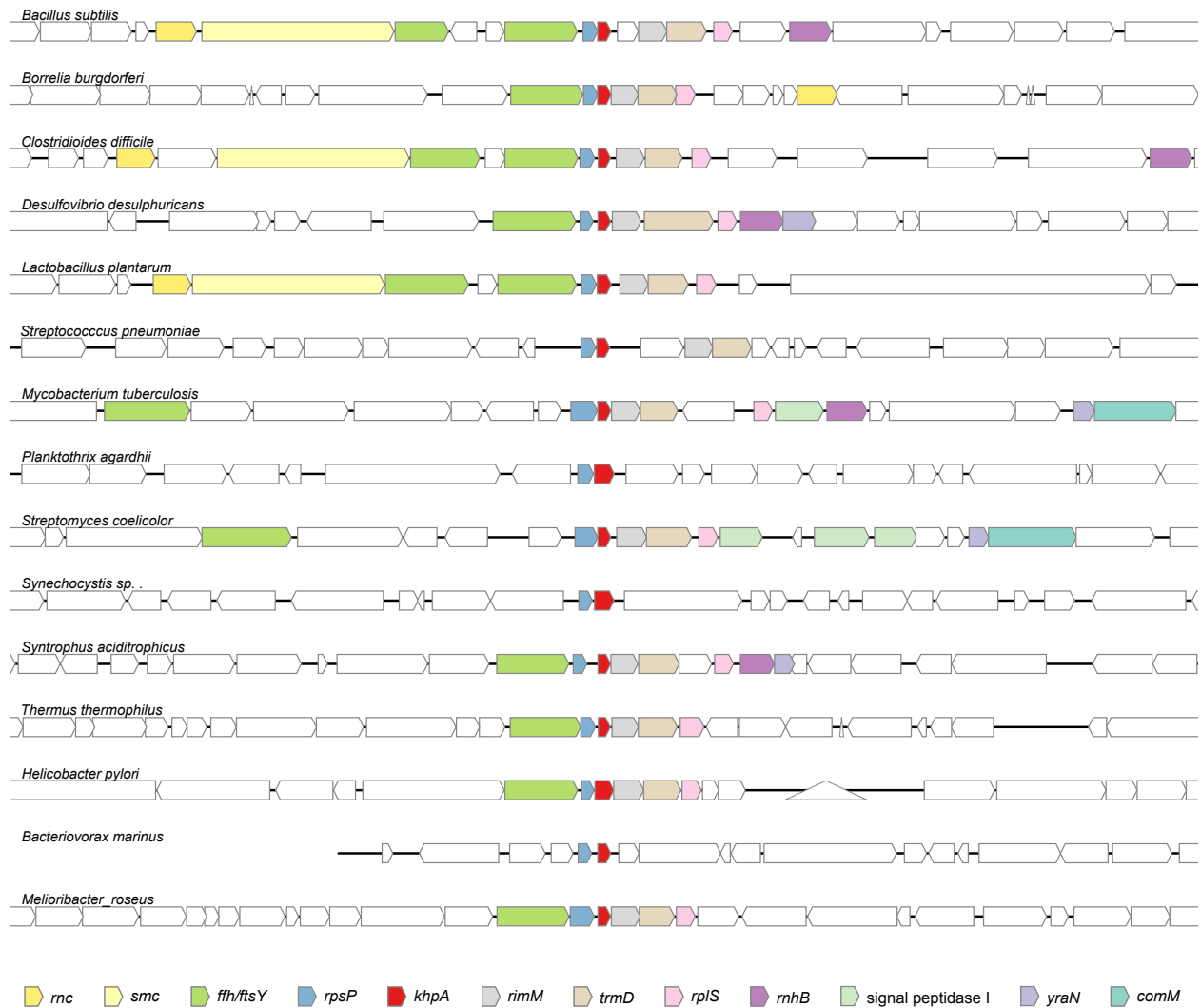
Fig. S2. Gene synteny surrounding khpA .

Orthologous gene families surrounding khpA genes for organisms shown in Fig. 1 were identified using OrthoFinder (version 2.3.8). Genome synteny was visualized with a custom script. The large triangle indicates the position of a gene encoding the 16S rRNA.