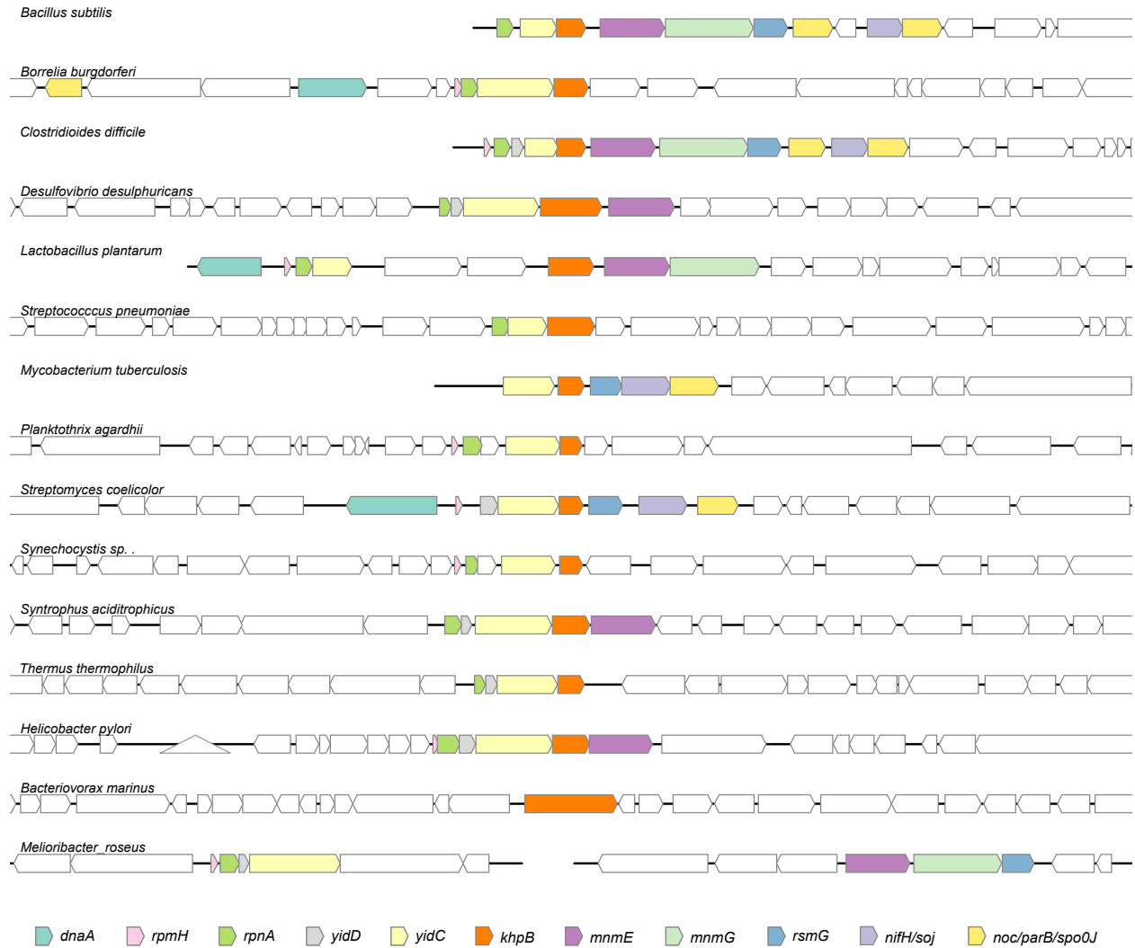
Fig. S3. Gene synteny surrounding khpB .

Orthologous gene families surrounding khpB genes for organisms shown in Fig. 1 were identified using OrthoFinder (version 2.3.8). Genome synteny was visualized with a custom script. The large triangle indicates the position of a gene encoding the 16S rRNA.