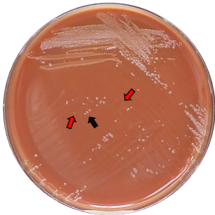
LVS Biofilm Positive Population 25