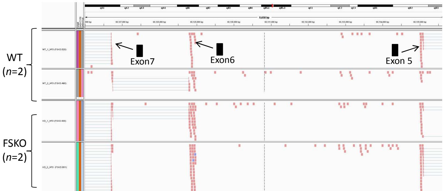
Supplemental Figure 1. Deletion of Arid5b Exon 6 in purified adipocytes but not in livers from mice fed a high fat diet (HFD). RNA-Seq was performed as described in materials and methods. Read files were aligned to the mm10 assembly surrounding Arid5b Ex 6