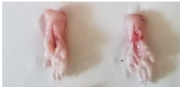
Zn-Al LDH/Levo nanocomposite