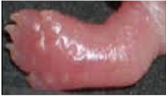
Hind limb induced formalin