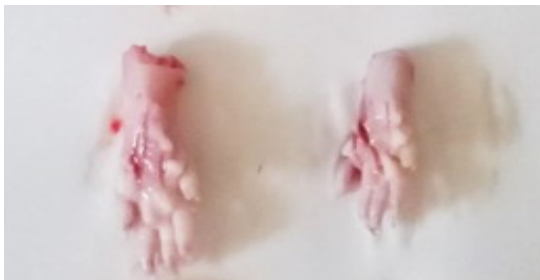
Normal form of Levofloxacin