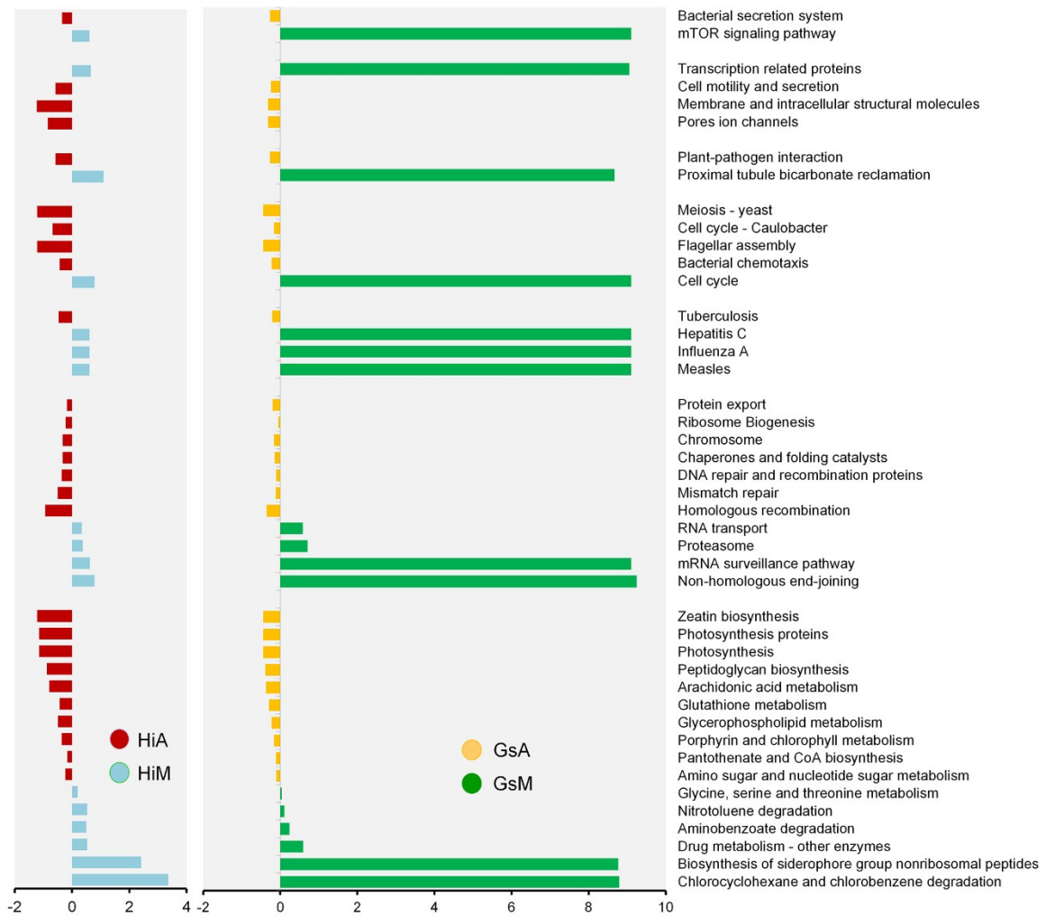
Figure S2 Comparison of the impact of differences between fresh mulberry leaves and the artificial diet on silkworm gut microbiome. Two silkworm strains that were reared on fresh mulberry ( Morus alba var. multicaulis ) leaves, named HiM and GsM, and two strains that were reared on an artificial diet, HiA and GsA. They were reared on fresh mulberry ( Morus alba var. multicaulis ) leaves, named HiM and GsM, and were reared on an artificial diet, named HiA and GsA. Predicted functional analysis of the silkworm gut microbiomes based on the PICRUSt software tool. The barplot show pathways that were significantly enriched ( P < 0.05 ) as determined by one-way ANOVA. Fold change represents value of HiM / HiA or GsM / GsA.