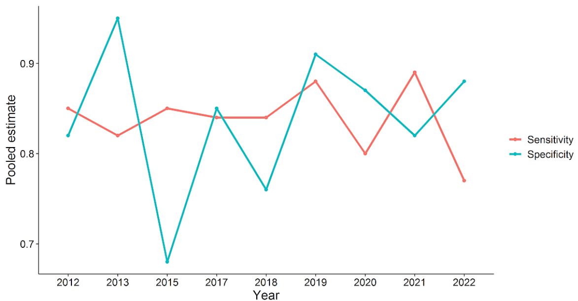
Supplementary Figure 3. Pooled estimates of sensitivity and specificity calculated on all models of studies stratified by year of publication. Linear regression was performed on both sensitivity and specificity across the years and no significant linear trend was observed. For both sensitivity and specificity, the linear regression estimates were around 0.