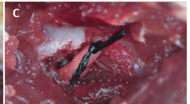
L5 nerve root ligation