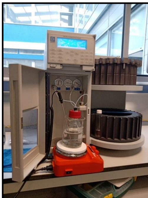
Figure S1. Equipment used to perform the pressurized Natural Hydrophobic Eutectic Solvents (NaHDES) extraction (ASE 200 device - Dionex, USA), with the bottle of respective solvents maintained at 90 °C.