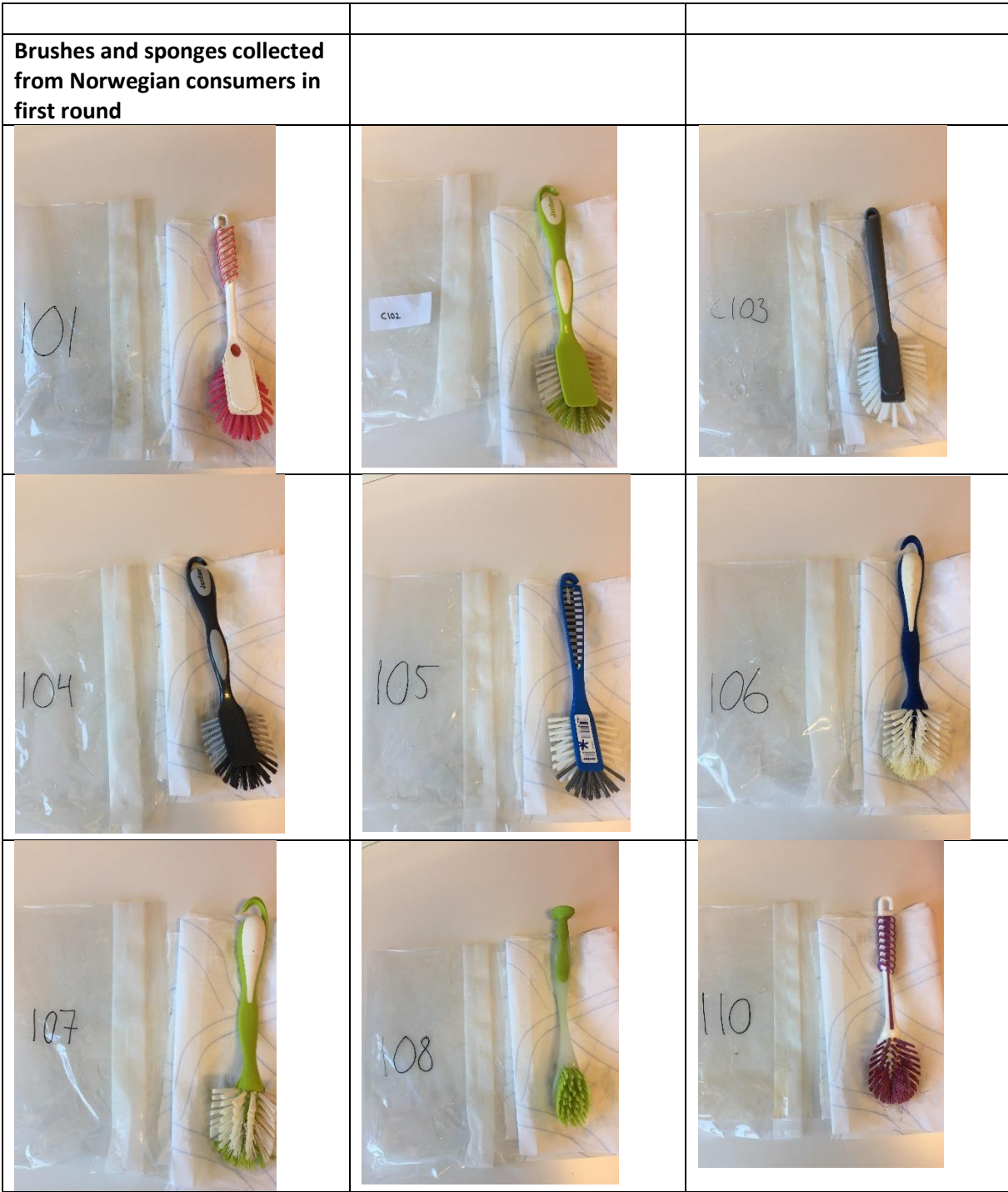
Supplementary figure 1. Photos of sponges and brushes collected from consumers in Norway and Portugal