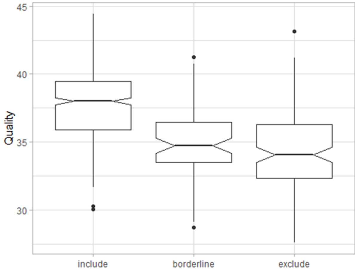
Supplementary Figure 1: Heidelberg SPECTRALIS OCTA Quality Score (Q Score) versus manual quality assessment.