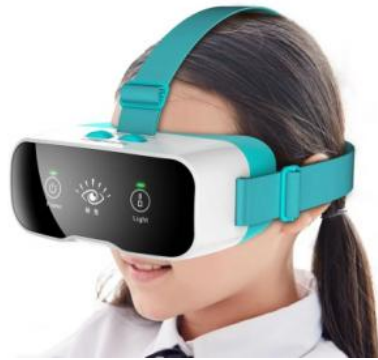
Figure1 Part A