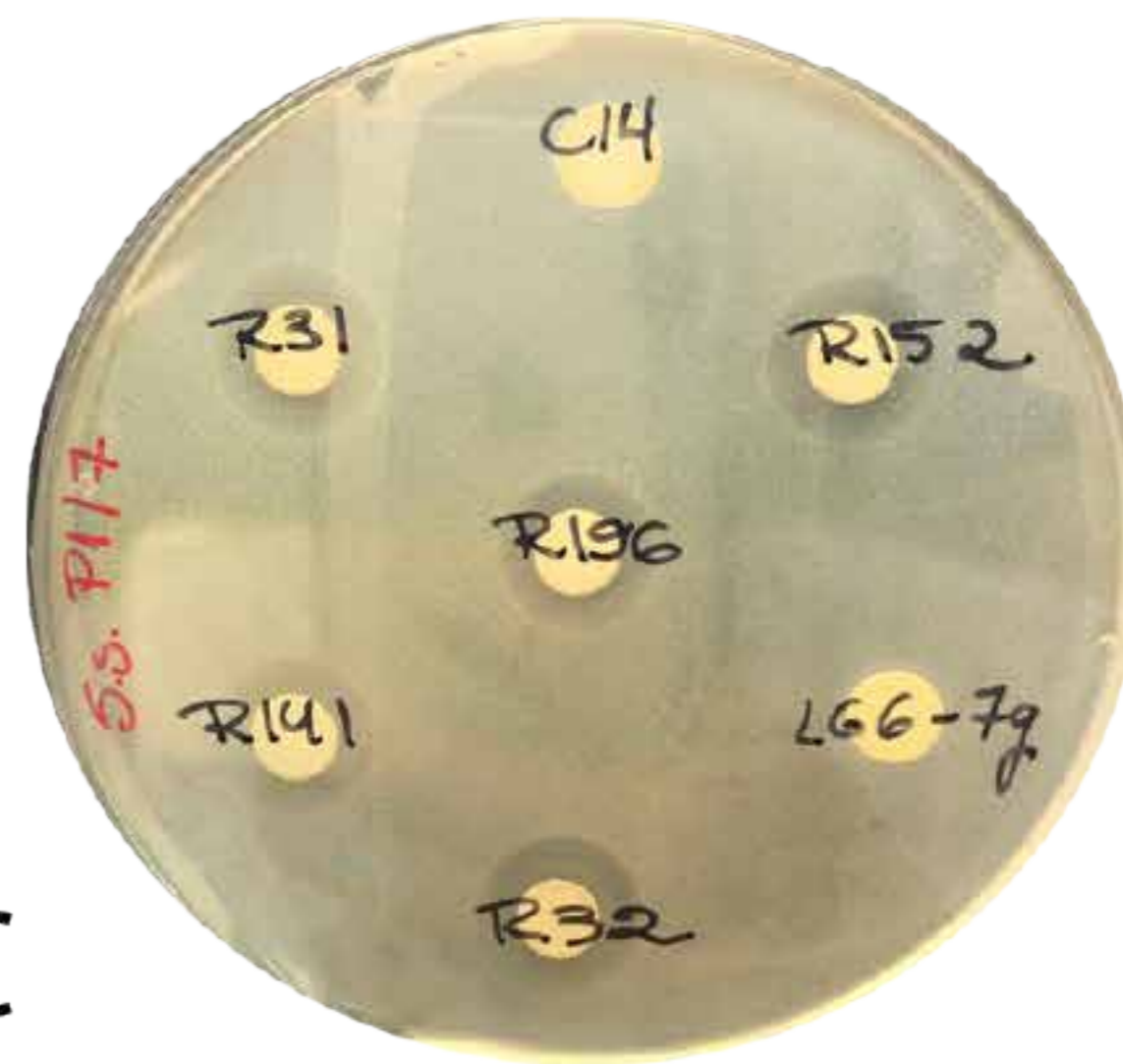
Supplementary Figure 1. A) Columbia agar plate containing bacterial colonies; insert showing two Rothia colonies selected on basis of colony morphology, B and C) Screening overlay inhibition assays on agar plates to identify colonies inhibiting growth of target bacteria in the overlay and inhibition zones ("halos") where the growth of target bacteria is inhibited by products secreted by candidate antagonist.