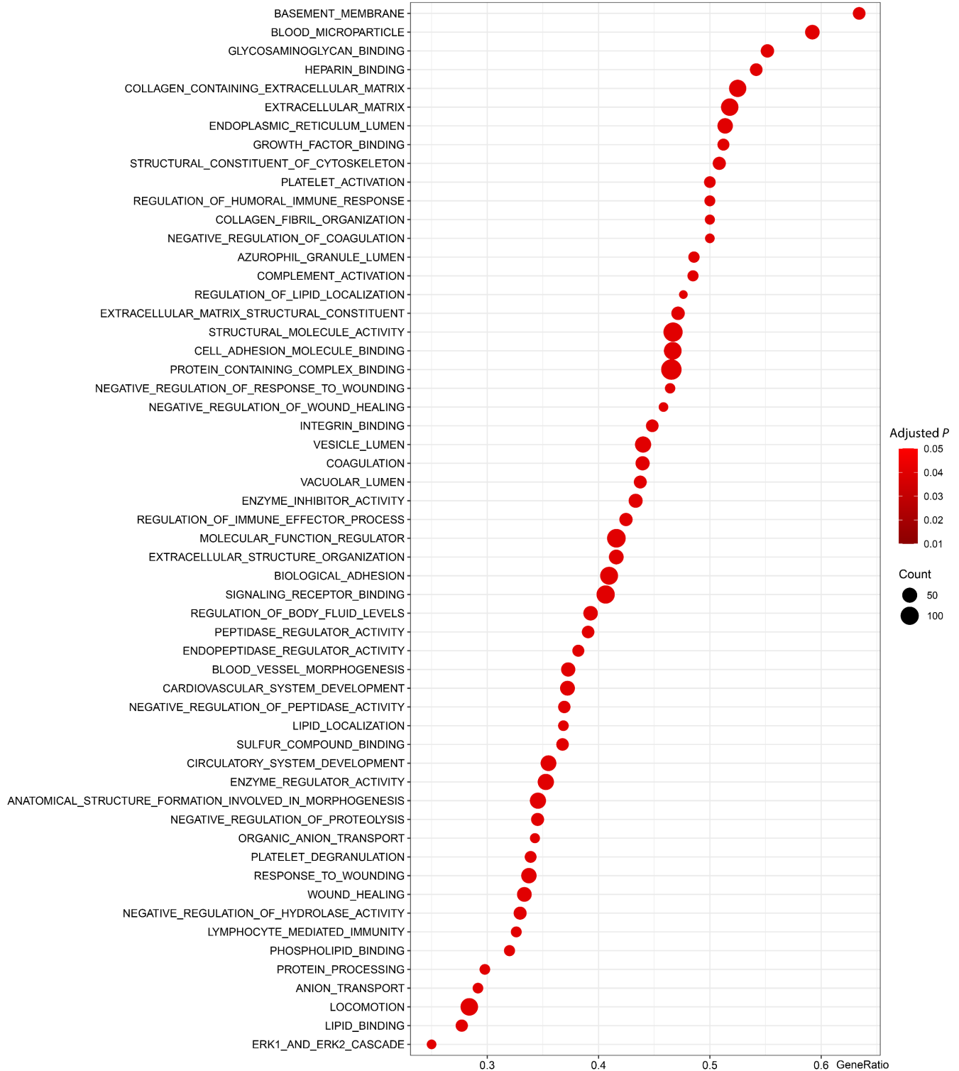
CAF cells vs HPDE