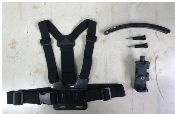
Figure 3. A chest strap and extended arm