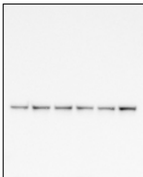
Uncropped and unprocessed western blot (WB) scans for Extended Data Figure 6a.