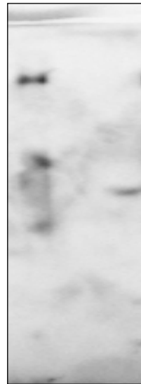
Uncropped and unprocessed western blot (WB) scans for Figure 2h.