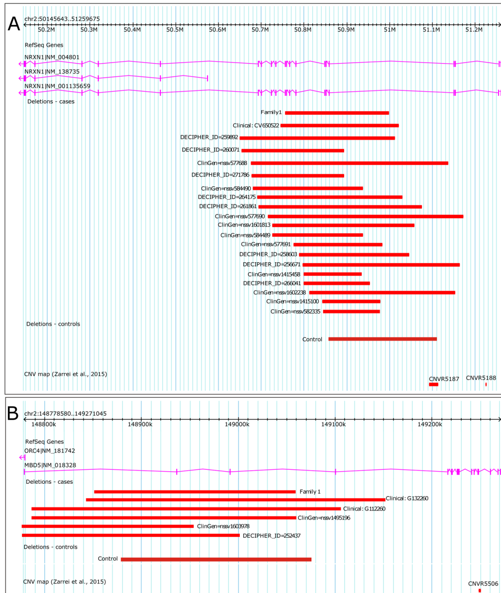
Figure 2. CNVs overlapping the family's NRXN1 (A) and MBD5 (B) CNV deletion from clinical ('clinical') and population ('controls') datasets, and DECIPHER and ClinGen Family 1 refers to family described in the text